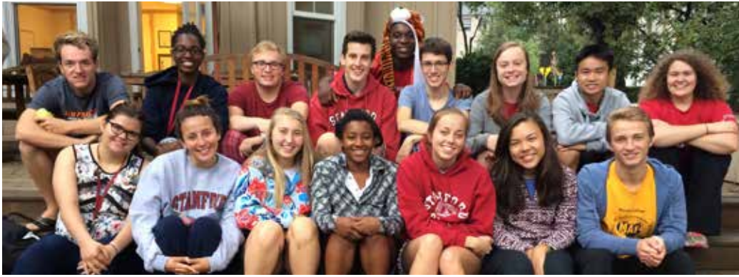
Haas Center Frosh Service Liaisons 2015–16.