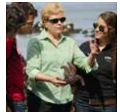
2013 Distinguished Visitor Jane Lubchenco (second from right) with students.