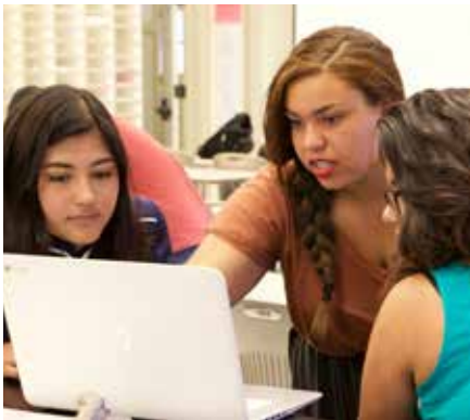
(left) Participants in EDUC 103B: Race, Ethnicity, and Linguistic Diversity in Classrooms: Sociocultural Theory and Practices . (right) Students at the Haas Center's Senior Send-off.