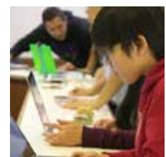
Students in the new student organization CS+Social Good put tech to use for the public good.