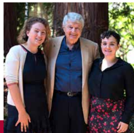
Miriam Aaron Roland Volunteer Service Prize