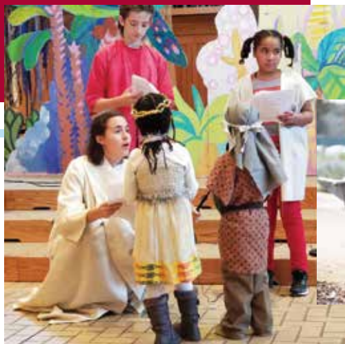
#ChoosePublicService, p. 7