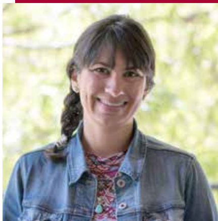
Kennedy-Diamond Award for Excellence in Community-Engaged Learning and Research