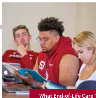
What End-of-Life Care Taught Me About Medicine Beyond Medication, p. 3