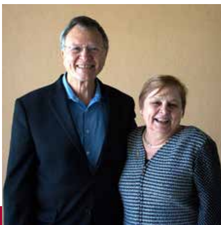
Friends of Haas Award